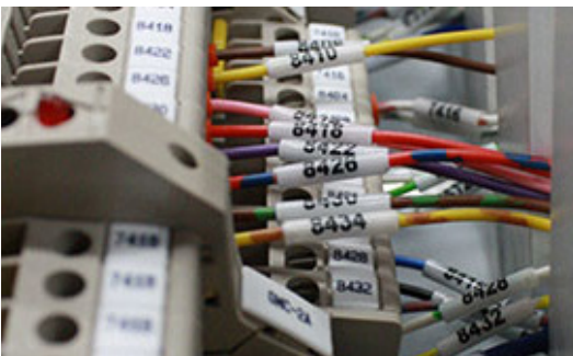
Custom Labels and Wire Labels